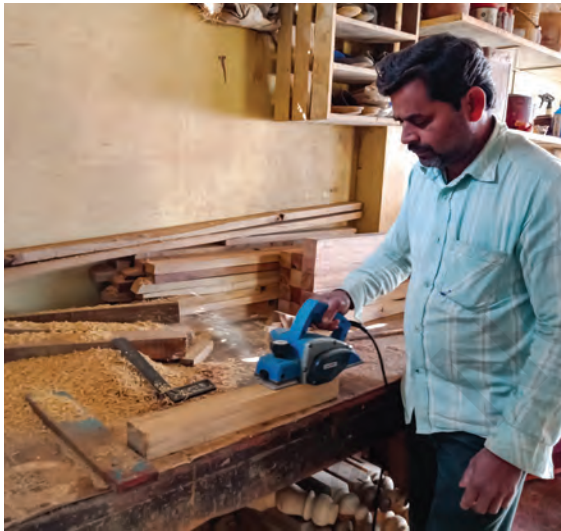
Fig. 7.5. Carpenter