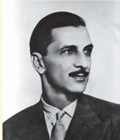
Fig. 7.17. J.R.D. Tata

Jehangir Ratanji Dadabhoy (J.R.D.) Tata was one of India's greatest entrepreneurs and played a big role in building modern India. He was born in 1904 and became the head of the Tata Group, one of the largest business groups in the country. He believed that businesses should not only make money but also help society. He started India's first airline, Tata Airlines, in 1932, which later became Air India. Under his leadership, the Tata Group expanded into many areas like steel, cars, power, and chemicals. J.R.D. Tata was also known for caring about his workers and believed in providing them with good working conditions. He was a man of vision, hard work, and honesty. In 1992, he received the Bharat Ratna, India's highest civilian award, for his great service to the nation.