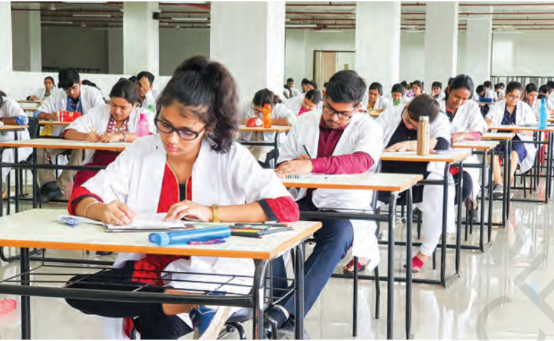
Fig. 7.8. Students writing an exam

According to the Economic Survey of India 2024, 65 per cent of people in India are below the age of 35 years. This means that India has a young, productive population, which may help the country reap the benefits of a demographic dividend. The demographic dividend refers to the benefit a country gets when it has a large number of young and working people. When more people are working and earning, and fewer people depend on them, the country can grow businesses and improve living standards. To take advantage of this potential, individuals must have access to quality education, health, training, and skilling, which would contribute to the nation's progress. You will learn more about this in the year ahead in the chapter on Demographics.