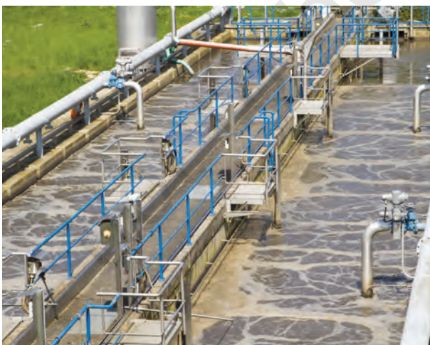
Fig. 7.24. Recycling industrial wastewater before releasing it into water bodies

So, it is important for producers to adopt sustainable practices to replenish natural resources for future use.