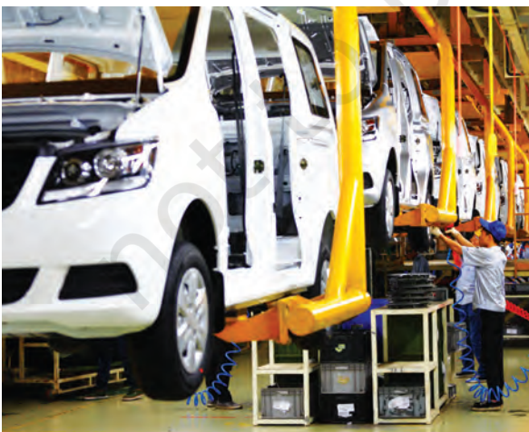
Fig. 7.10. Machinery

Capital is essential to a manufacturing unit or a services sector enterprise. But where do businesses get the capital? Generally,