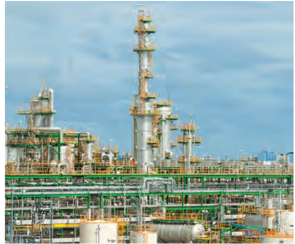
Fig. 7.15. Petrochemical plant

Startup A startup is an entrepreneurial venture with limited resources that aims at rapid growth and expansion while leveraging technology.