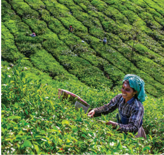
Fig. 7.3. Worker at a tea plantation