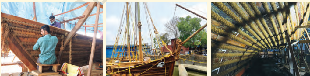
Fig. 7.9. Re-creation of a 5 th -century stitched ship

Indians used a unique stitching technique dating back over 2000 years to make ships and boats, which they used to conduct maritime trade and cultural exchanges across the Indian Ocean. The technique involved stitching wooden planks together using cords instead of nails, which made them flexible and helped the ships navigate the Indian Ocean with ease.