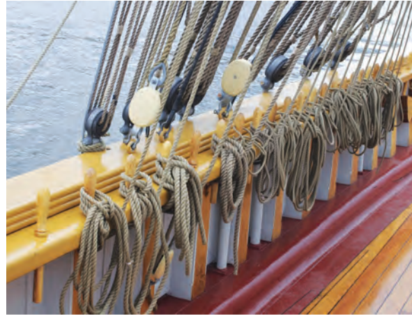
Fig. 7.21. Pulley used in boats

Now, let's look at examples of how technology is helping students learn, build new skills, and find jobs.