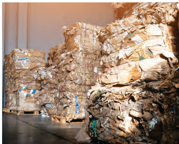
Fig. 7.25. Use of recycled products as inputs