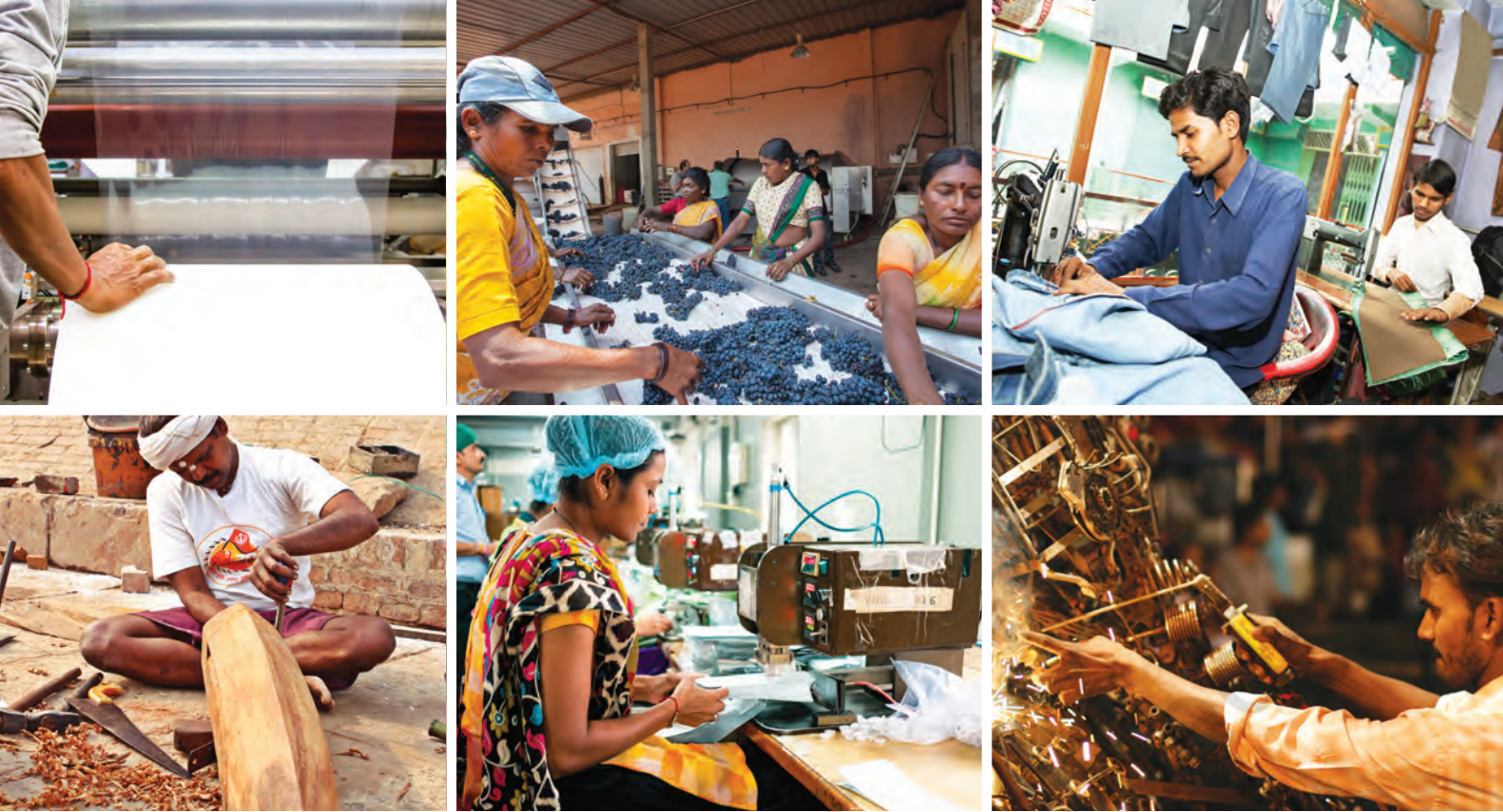
Fig. 7.2. A glimpse at the production of some goods