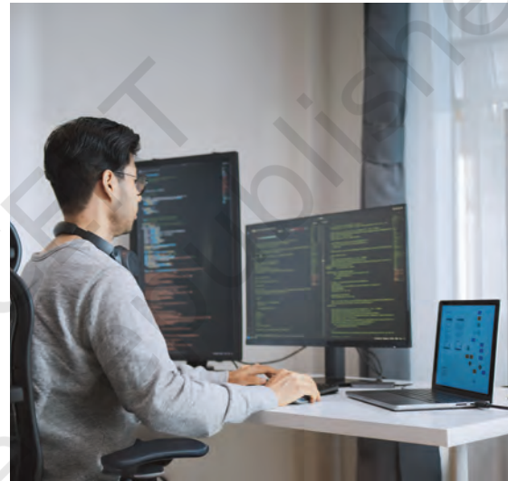
Fig. 7.6. Software developer

a good job. The word labour refers to the physical and mental effort used in production. However, human capital refers to the specialised skills, knowledge, abilities and expertise required to perform that labour. Thus, human capital is not just the basic efforts of labour but also the quality and efficiency of that labour.