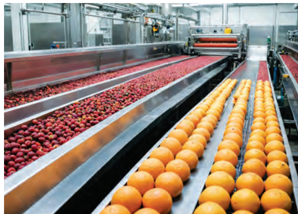
Fig. 7.13. Food processing