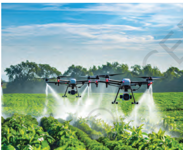
Fig. 7.18. Drones spraying fertilisers to improve crop health

Today, newer and advanced technological developments are applied in various areas, making our lives easier. For example, payments can be made at the click of a button through UPI (Unified Payments Interface); farmers can get advance weather updates; Global Positioning Systems (GPS) can discover the shortest routes for transporting goods, and so on.