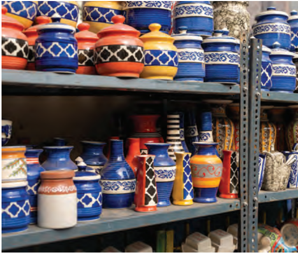
Fig. 7.14. Pottery products, Delhi