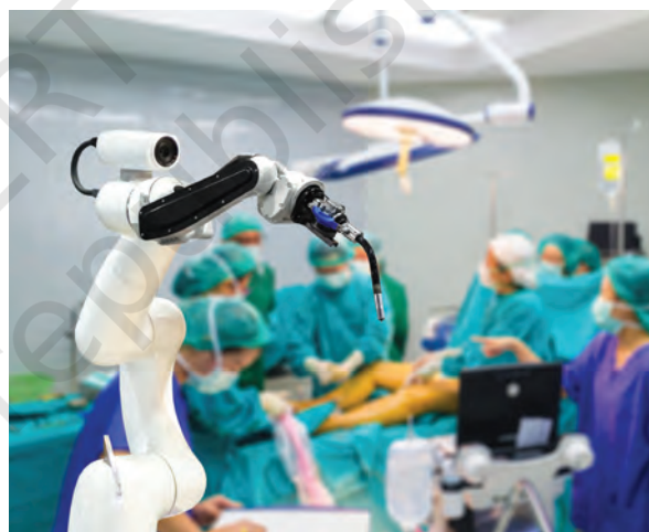
Fig. 7.19. Robots assisting in surgical processes

Have you noticed how old technology gets replaced by a new, better one?