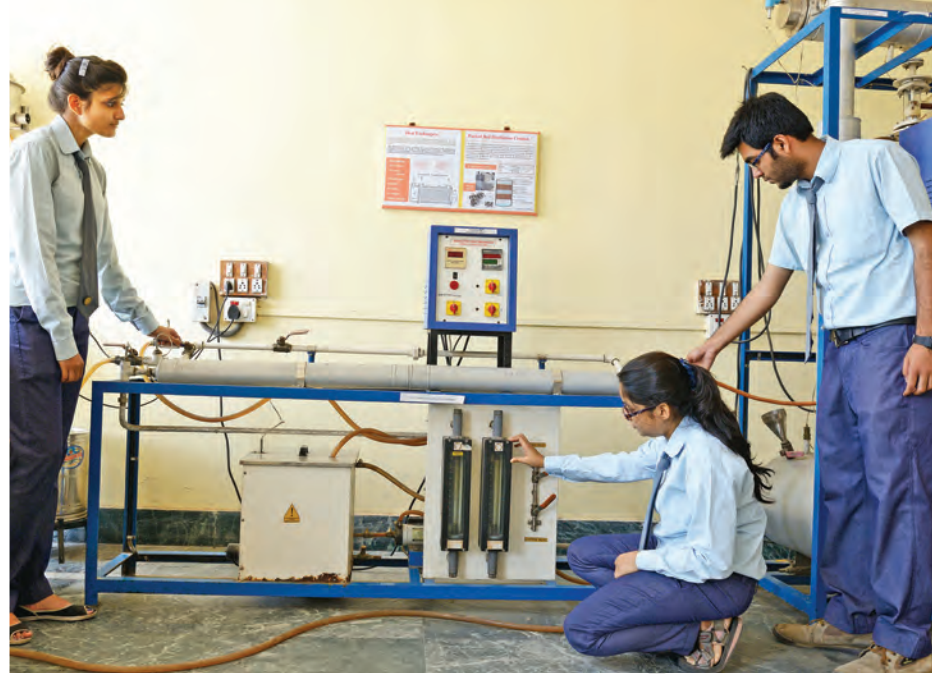
Fig. 7.7. Education and training