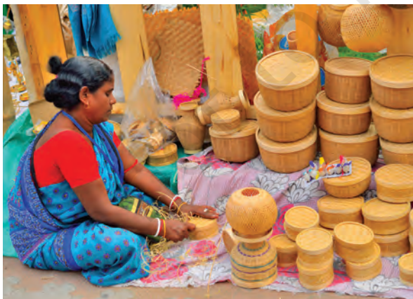
Fig. 7.12. Bamboo and cane products, Arunachal Pradesh

Entrepreneurship means starting your own business or creating something new to solve a problem. An entrepreneur is a person