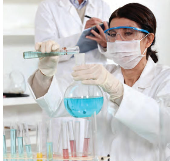
Fig. 7.4. Chemical engineer