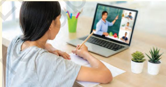
Fig. 7.22. Online learning