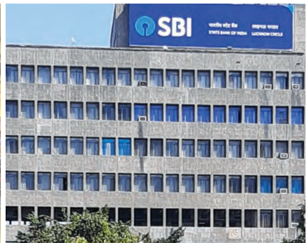
Fig. 7.11. Loans