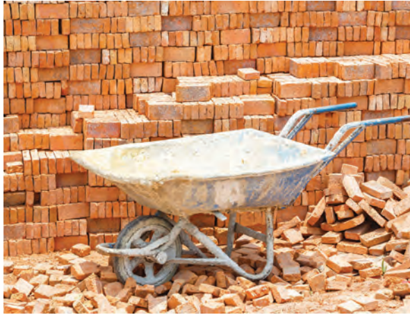
Fig. 7.20. A wheelbarrow on a construction site