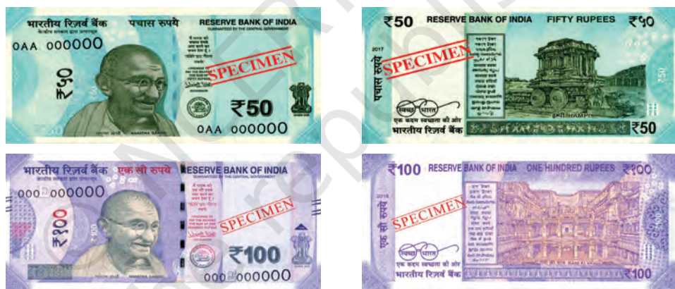
Fig. 11.16. Paper currency today