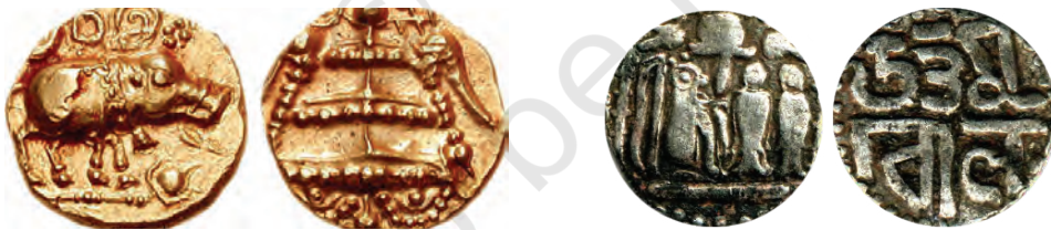
Coinage from Chalukyas of Kalyana featuring Varaha (avatar of Viṣṇu) and Royal Parasol

Obverse: the side of a coin or medal bearing the head or principal design.