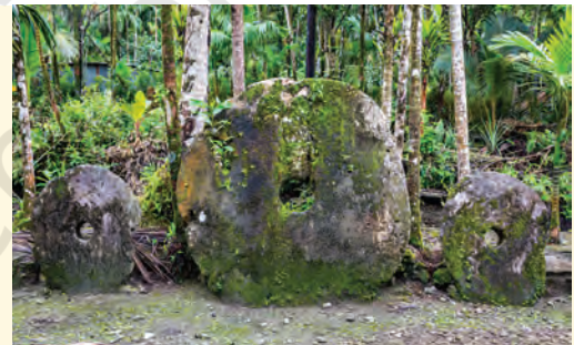
Fig. 11.2.1. Stone Money: Giant discs of rock – called Rai stones – were used as money on the Yap Island, in the Pacific Ocean country of Micronesia.

The barter system was the earliest form of exchange. There is a lot of evidence of it from around the world. People used commodities such as cowrie shells, salt, tea, tobacco, cloth, cattle (cows, goats, horses, sheep), seeds, etc.