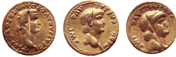
Fig. 11.12. Roman gold coins excavated in Pudukottai India

The use of coinage helped boost India's maritime trade with the world. For example, they were found in parts of Kerala and Tamil Nadu. This throws light on the trading activities of southern India with the rest of the world. Based on this finding, scholars conclude that the trade was in favour of India.