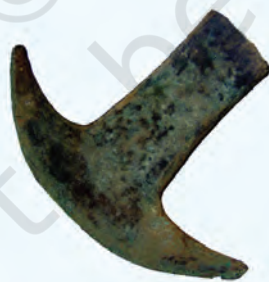
Fig.11.2.2. The Aztec copper Tajadero (Spanish word for chopping knife) was a form of money used in Central Mexico and parts of Central America.