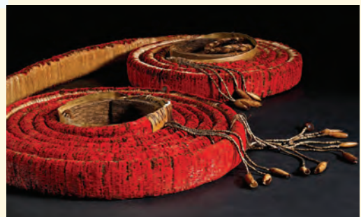
Fig. 11.2.3. Tevau (Red feather coil made from birds' feathers) used as money on the Solomon Islands.