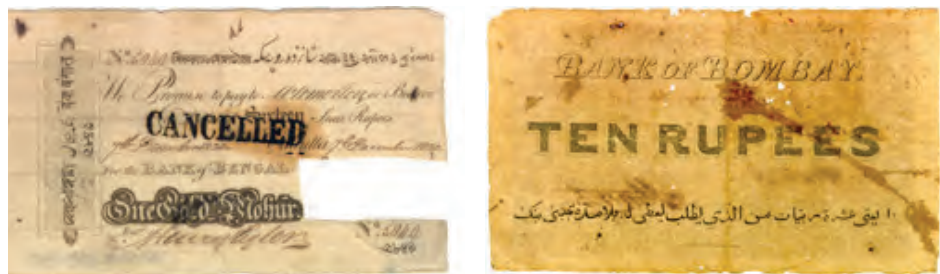
Fig. 11.15. Uniface notes of Bank of Bengal (Left) and Ten rupee note from Bank of Bombay

with the use of paper money. Paper money or currency was first used in China and was introduced in India in the late 18th century.