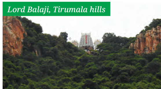
Lord Balaji, Tirumala hills