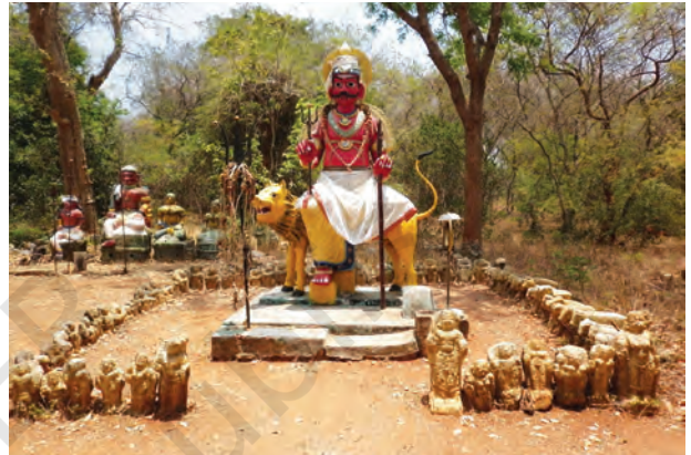
Fig. 8.16. Udaiyankudukadu Karumbayiramkondan, Tamil Nadu

Given below are the names of a few sacred groves in a few regional languages of India. Can you add to this?