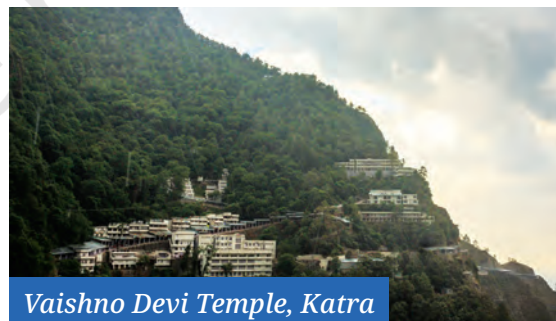
Vaishno Devi Temple, Katra