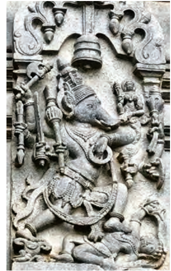
Fig. 8.5. In this image, Viṣṇu in the form of his boar avatar crushes a demon and saves Bhūdevī (Mother Earth), shown here sitting on his elbow (from the Belur temple, Karnataka)

This tradition comes from the perception of a divine presence in all of Nature. Ultimately, the whole of planet Earth is considered sacred—she is Mother Earth or Bhūdevī.