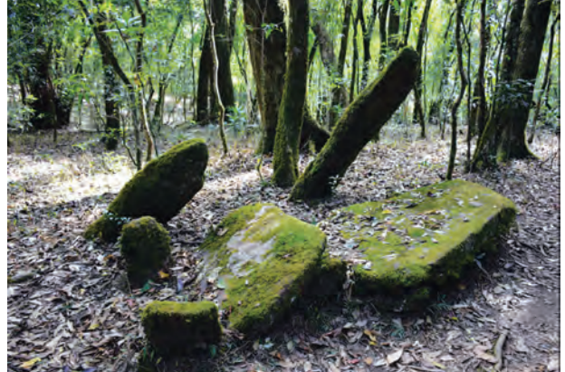
Fig. 8.14. Mawphlong, Shillong