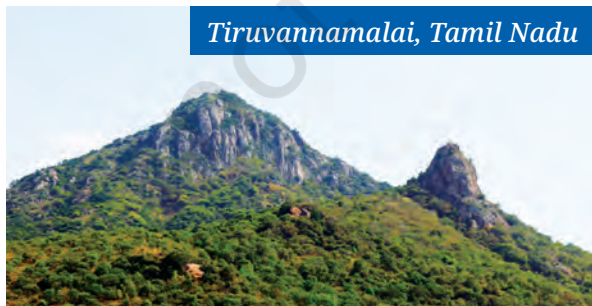
Tiruvannamalai, Tamil Nadu