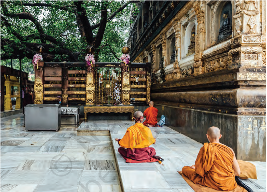
Fig. 8.10. The tree in the Mahabodhi Temple at Bodh Gaya is often cited as a direct descendant of the original tree under which, according to Buddhist tradition, the Buddha attained enlightenment—hence the names ‘bodhi tree’ and ‘Bodh Gaya’.

In many parts of India, trees are adorned with offerings like turmeric and kumkum . One species of fig tree commonly called ‘peepul’ (or ‘pipal’), ‘bo tree’ or ‘bodhi tree’ ( aśvattha in Sanskrit) is sacred to Hinduism, Buddhism, Sikhism and Jainism. In fact, its botanical name is Ficus religiosa (literally, in Latin, the ‘religious’ or sacred fig tree).