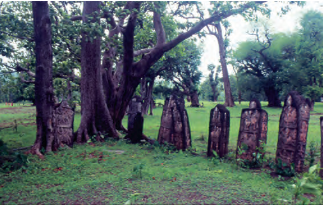
Fig. 8.15. From the sacred groves of the Bhils