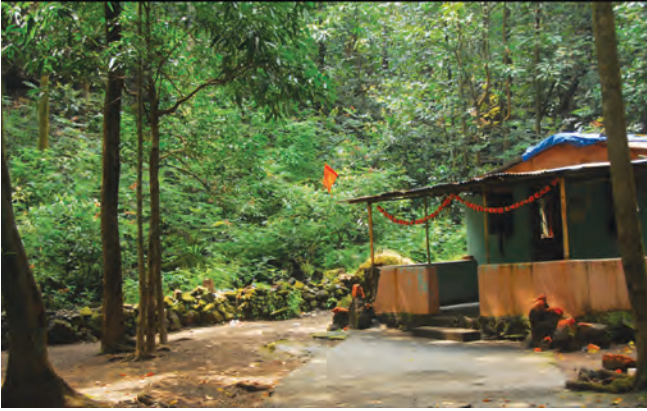
Fig. 8.13. Kalkai temple, Mulshi, Maharashtra