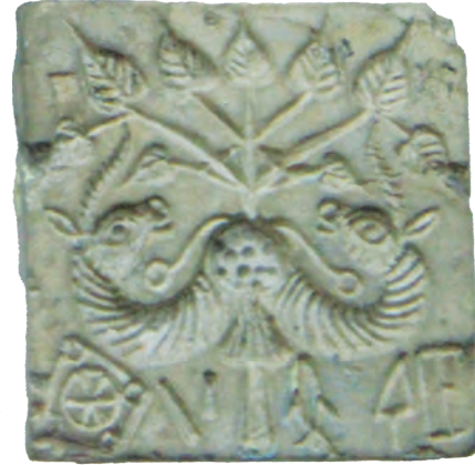
Fig. 8.12. A seal from Mohenjo-daro

Observe this seal from Mohenjo-daro. Can you recognise the leaves at the top? As you can see, the peepul tree has been an important part of India's cultural geography for millennia.