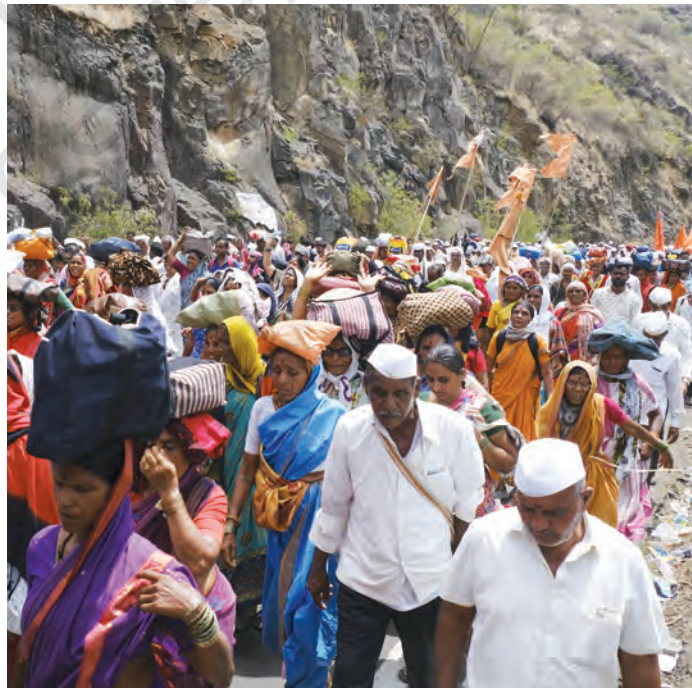
Fig. 8.4. Pandharpur wārī, an 800-year-old tradition in Maharashtra. Wārī means a pilgrimage that is held regularly, in this case annually. Pilgrims walk in large groups for 21 days to the famous Vithoba temple in Pandharpur.

Tirthankara: Literally, someone who makes a tīrtha, that is, who guides the crossing from ordinary to higher life. In Jainism, the Tirthankaras are the supreme preachers of dharma.