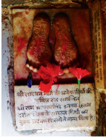
Fig. 8.11. A shrine in Bastar, Chhattisgarh, celebrating Rāma's passing through the area