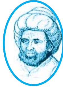
Muhammad ibn Musa al-Khwarizmi (C.E. 780 – 850)

A lemma is a proven statement used for proving another statement.