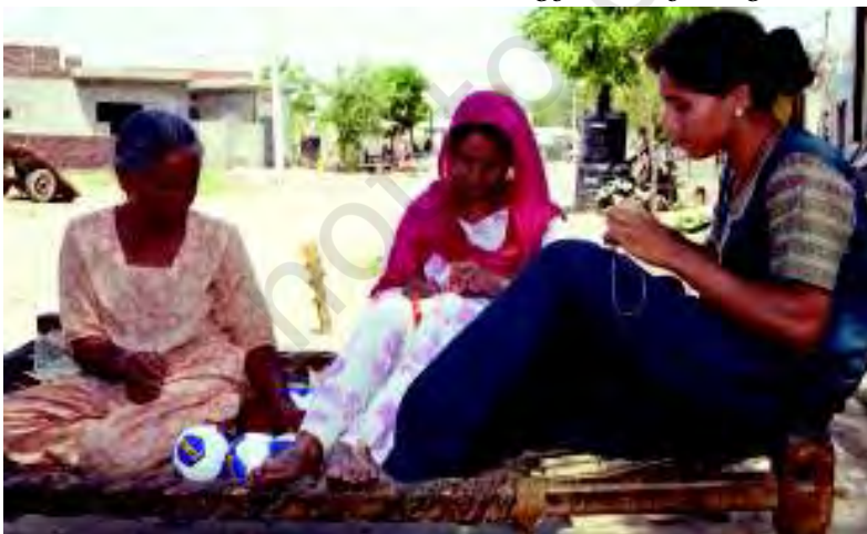
Women at home in Ludhiana making footballs for large MNCs

There's another way in which MNCs control production. Large MNCs in developed countries place orders for production with small producers. Garments, footwear, sports items are examples of industries where production is carried out by a large number of small producers around the world.