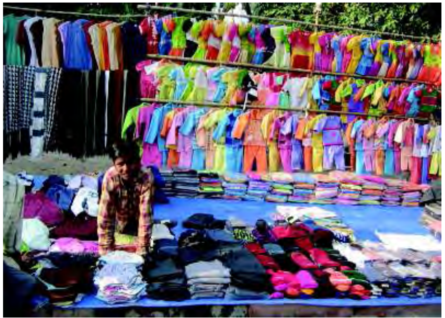
Small traders of readymade garments facing stiff competition from both the MNC brands and imports.

In general, with the opening of trade, goods travel from one market to another. Choice of goods in the markets rises. Prices of similar goods in the two markets tend to become equal. And, producers in the two countries now closely compete against each other even though they are separated by thousands of miles! Foreign trade thus results in connecting the markets or integration of markets in different countries.