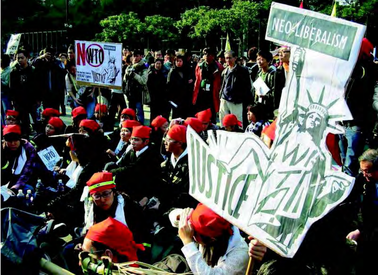
A demonstration against WTO in Hong Kong, 2005