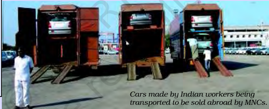
Cars made by Indian workers being transported to be sold abroad by MNCs.