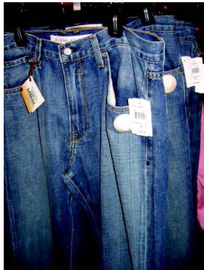
Jeans produced in developing countries being sold in USA for Rs 6500 ($145)

The products are supplied to the MNCs, which then sell these under their own brand names to the customers. These large MNCs have tremendous power to determine price, quality, delivery, and labour conditions for these distant producers.