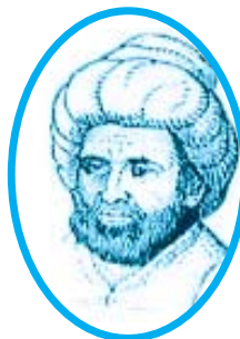
Muhammad ibn Musa al-Khwarizmi (C.E. 780 – 850)

A lemma is a proven statement used for proving another statement.